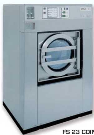
FS 23 COIN