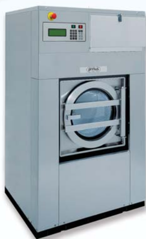
FS 23 PRO